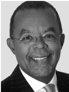
Henry Louis Gates Jr., Ph.D. Chair Director, Hutchins Center for African and African American Research Harvard University

An independent panel of internationally respected jurors selects the Anisfield-Wolf winners. The current jury is chaired by Henry Louis Gates Jr. and includes Rita Dove, Joyce Carol Oates, Steven Pinker, and Simon Schama.