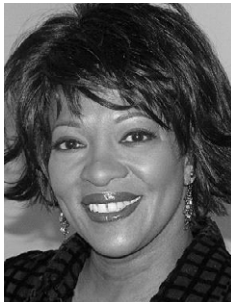
Rita Dove Commonwealth Professor of English University of Virginia