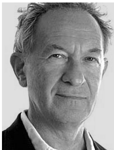
Simon Schama, Ph.D. University Professor of History and Art History Columbia University