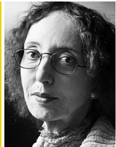
Joyce Carol Oates Roger S. Berlind '52 Professor in the Humanities Emerita Princeton University