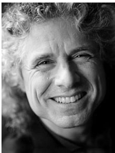
Steven Pinker, Ph.D. Johnstone Family Professor of Psychology Harvard University