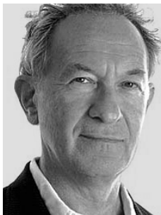
Simon Schama, Ph.D. University Professor of History and Art History Columbia University