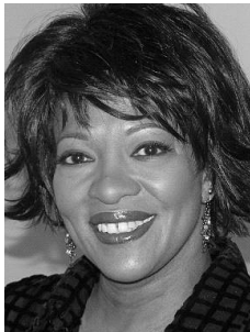
Rita Dove Commonwealth Professor of English University of Virginia