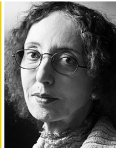
Joyce Carol Oates Roger S. Berlind '52 Professor in the Humanities Princeton University