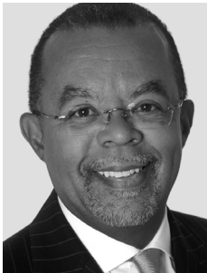
Henry Louis Gates Jr., Ph.D. Chair Director, Hutchins Center for African and African American Research Harvard University

An independent panel of internationally respected jurors selects the Anisfield-Wolf winners. The current jury is chaired by Henry Louis Gates Jr. and includes Rita Dove, Joyce Carol Oates, Steven Pinker, and Simon Schama.