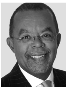
Henry Louis Gates Jr.

An independent panel of nationally known jurors selects the Anisfield-Wolf winners. The current jury is chaired by Dr. Henry Louis Gates Jr. and includes Rita Dove, Joyce Carol Oates, Steven Pinker, and Simon Schama.