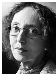
Joyce Carol Oates

Commonwealth Professor of English University of Virginia