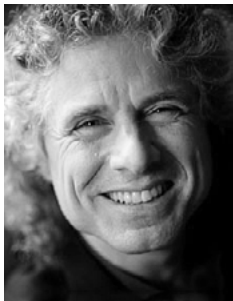
Steven Pinker, Ph.D.

Roger S. Berlind '52 Professor in the Humanities Princeton University