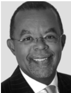
Henry Louis Gates Jr. Chair Alphonse Fletcher University Professor Harvard University

An independent panel of nationally known jurors selects the Anisfield-Wolf winners. The current jury is chaired by Dr. Henry Louis Gates Jr. and includes Rita Dove, Joyce Carol Oates, Steven Pinker, and Simon Schama.