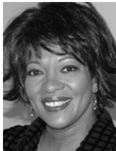
Rita Dove Commonwealth Professor of English University of Virginia