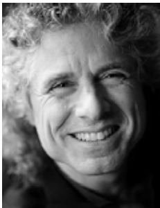
Steven Pinker, Ph.D. Johnstone Family Professor of Psychology Harvard University