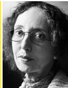
Joyce Carol Oates Roger S. Berlind '52 Professor in the Humanities Princeton University