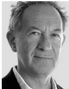
Simon Schama, Ph.D. University Professor of History and Art History Columbia University