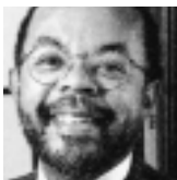
Henry Louis Gates Jr.

An independent panel of nationally known jurors selects the Anisfield-Wolf winners. The current jury is chaired by Dr. Henry Louis Gates Jr. and includes Rita Dove, Joyce Carol Oates, Steven Pinker and Simon Schama.