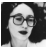
Joyce Carol Oates

Commonwealth Professor of English University of Virginia