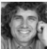
Steven Pinker, Ph.D.

Roger S. Berlind '52 Professor in the Humanities Princeton University