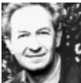
Simon Schama, Ph.D.

Johnstone Family Professor of Psychology Harvard University